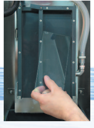
The unique sensing chamber design allows easy access to the controls and wetted components. The lamp/receiver unit is simply lifted and placed onto the convenient door rack. For any routine cleaning, the flow plate can be wiped in place or removed.